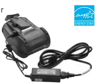
Shown with printer for reference purposes; printer is not included

Connect the AC adaptor to your QLn printer and mains socket to charge the printer's smart battery whilst in the printer. The printer can print labels and perform other functions during charging.