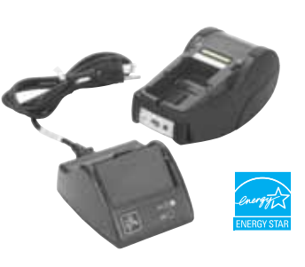
Shown with printer for reference purposes; printer is not included

The smart charger will fully charge a single standalone QLn smart battery in less than four hours. In addition to indicating battery charge status, it indicates battery health, allowing you to more accurately manage your spare battery pool. Specifically, LEDs show whether the battery is "good,"